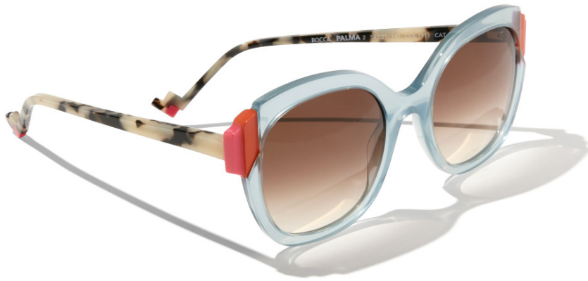
Bocca Palma2 col1911

Abundant sensuality and the feel of a glorious summer holiday for these brand new sunglasses in the iconic BOCCA range! Warm and enveloping the BOCCA PALMAs are inspired by the architecture of 1950s Florida and seem to come straight out of a film shot along Miami's famous beach front